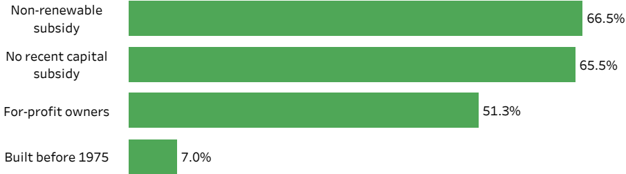
Exit Risk Characteristics for Federally Assisted Homes Expiring in the Next Five Years

66.5% of federally assisted homes expiring in the next five years have non-renewable subsidies